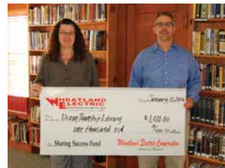
(Left to right): Dixon Township Library and Harper Hospital receive $1,000 grants from Wheatland's Sharing Success Fund.

The DIXON TOWNSHIP LIBRARY located in Argonia received a $1,000 grant to help purchase new books for their library in both the adult and children's sections. The money will also be used to purchase new bookshelves in their growing children's area. "We are so grateful for the Sharing