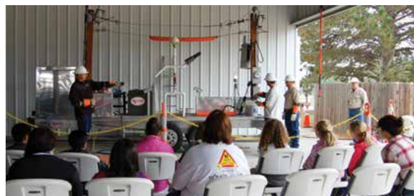
Wheatland linemen discuss the importance of electrical safety using the High-Voltage Safety Demonstration Trailer.

Wheatland linemen along with West recently gave an electrical safety demonstration to volunteer and rural firefighters in Conway Springs. At the program, 46 firefight-